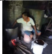
Figure 6. The process of boiling and filtering the wax material.

Commented [DKARD8]: Format as per the standards.