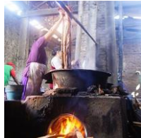
Figure 9: The wax boiling process through melorod by dipping a cloth in boiling water

After the final coloring process is completed, the wax boiling process melorod begins, which involves cleaning the wax from the fabric with a lorod solution. How to make a wax melorod solution with 50 liters of boiled water and 1/2 kg of soda ash. The melorod wax method, in which one piece of cloth is inserted and dipped into a boiling lorod solution with a stick. After the wax is removed from the cloth, it is removed, inserted, and washed in a regular water bath, removed again, and washed in the next water bath, and finally drained.