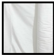
Figure 3. Cotton cloth

Cloth, printed wax dough, and fabric dyes are the raw materials required to make batik-patterned textile crafts using wax screen printing techniques. Cotton fabrics with an even texture and textured doobby cotton cloth are used to create wax print textile crafts. (See Fig. 3) In this study, a fine cloth of the Prima or Primissima type was used.