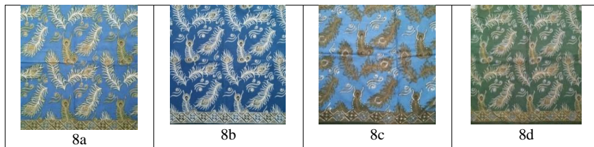
Figure 8: Textile products dyed using the dyeing technique