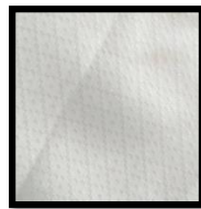
Figure 4. Dobby cloth

The raw materials for molded wax dough are wax, gondorukem (resina colophonium), resin, and turpentine (Fig.5). Comparison of these materials: 30 kg of wax + 2 kg of gondorukem + 2 kg of resin. To make molded wax dough, boil the three ingredients until they melt, then filter