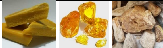
Figure 5. The gondorukem , and resin waxes Source: author.

The function of the wax in the printed wax mixture is to block the color in the cloth dyeing process. The gondorukem (resina colophonium) and resin serve to abide the wax to the cloth. Turpentine's function is to thin the dough and speed up the wax drying process.