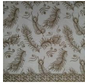
Figure 7. Cold wax printed cloth

and 80% yellow). After measuring each dye, the two colors are mixed in a bucket with 1 liter of water. The dye is now ready to be used for the fabric coloring process, both dab and dye.