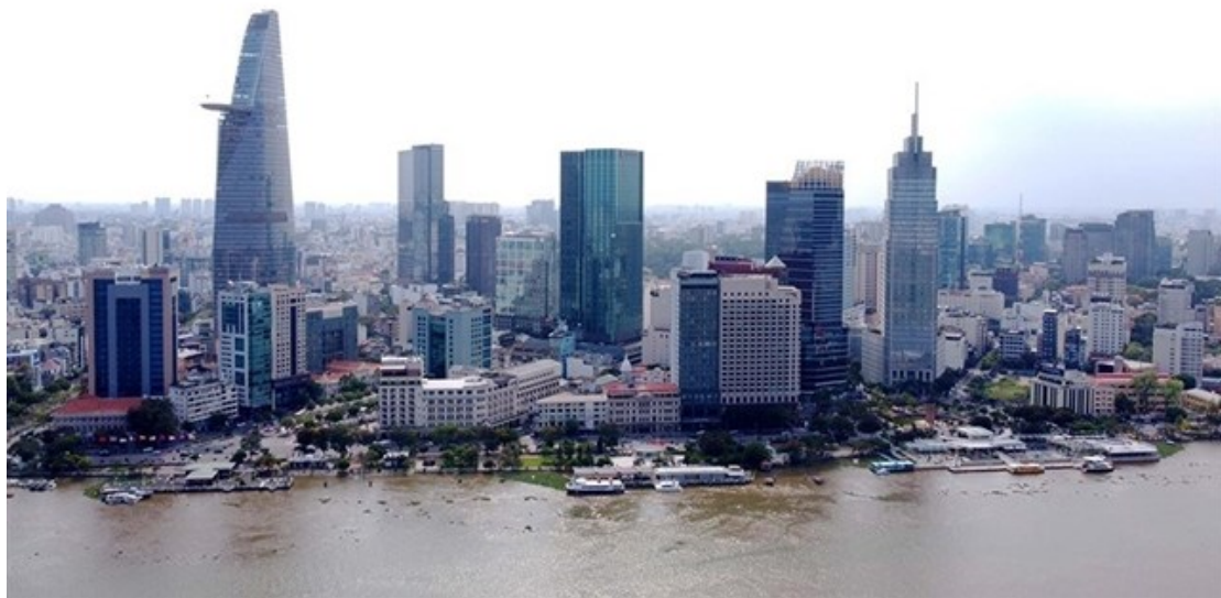
Fig. 2: A view of downtown HCM City

In this context, the role of governmental oversight is instrumental. State management influences the intricate balance between traditional and modern architectural elements, utilizing administrative authority and comprehensive management strategies to steer architectural development. Government actions play a decisive role in setting the direction for architectural progress, ensuring the alignment of development objectives with conservation efforts. This involves formulating and executing policies and strategies aimed at fostering architectural growth in both urban and residential sectors. The state's role is thus critical in creating an environment conducive to architectural preservation and innovation, ensuring that Ho Chi Minh City's architectural future is a reflection of its rich historical heritage, seamlessly blended with modern design paradigms.