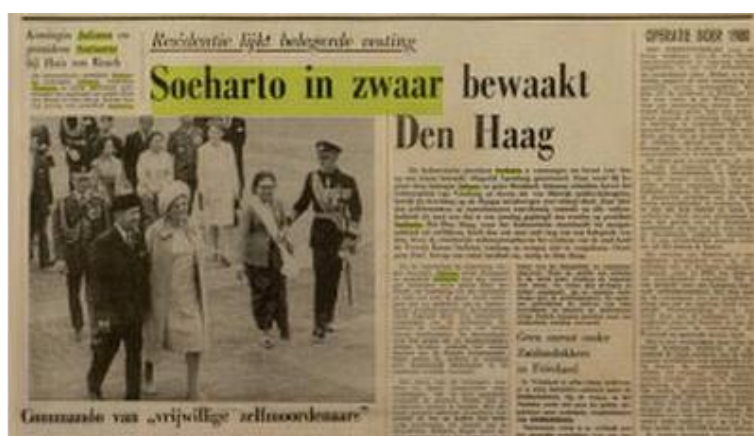
Fig. 1: Suharto visit The Hague

This paper reveals the existence of several paradoxes that occurred in Suharto's new order period. His approach was anti-colonialism but he also tried to cooperate with the Dutch. Then, the collaboration was discontinued and he focused on returning to preserving traditional Indonesian buildings.