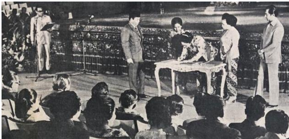
Fig. 3: Mrs. Tien Suharto signing the handover of the Indonesia traditional house

The focus on preserving traditional Indonesian architectural buildings was included in the creation of miniature traditional houses from various regions in Indonesia in the Indonesia Indah mini garden project. The Netherlands did not fund TMII, but the idea came from President Soeharto's wife, who wanted to introduce Indonesian culture to the world and even to the Indonesian people themselves so that they would love the culture of their homeland more than foreign culture. Some original traditional buildings from the area were brought from their place of origin as a gift from the Governor for the Development of Taman Mini Indonesia Indah in 1972. The picture below shows Mrs. Tien Suharto was seen signing the handover of the South Sulawesi traditional house from the Governor of South Sulawesi, H. Achmad Lamo, in the ceremony of handing over all the traditional houses 3